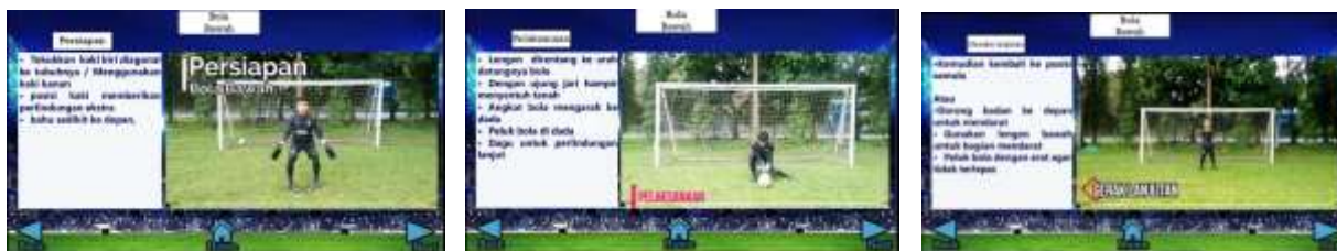
Figure 2. Sub Technique Display