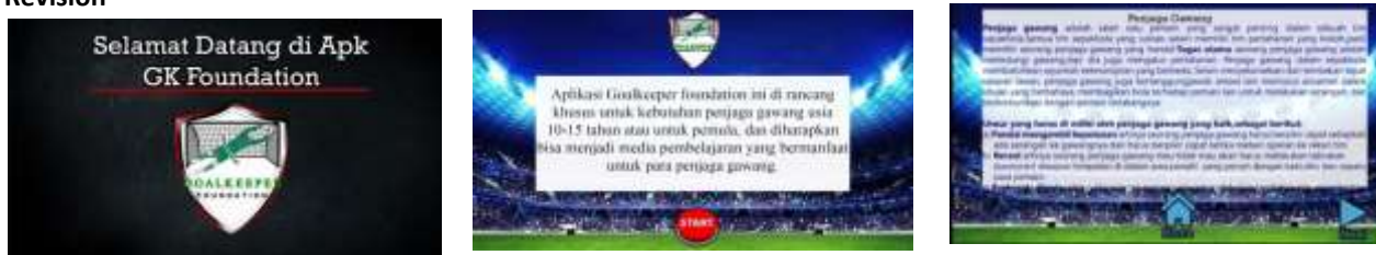
Figure 1. Home Screen Display and Goalkeeper Material